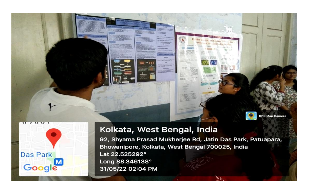
Judges interacting with students (Gr. B)