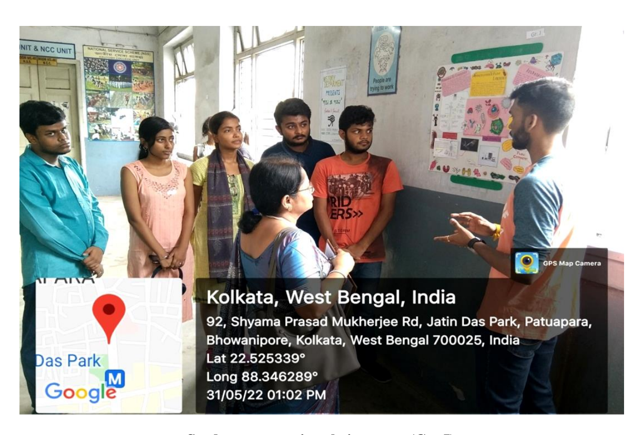
Students presenting their poster (Gr. J)