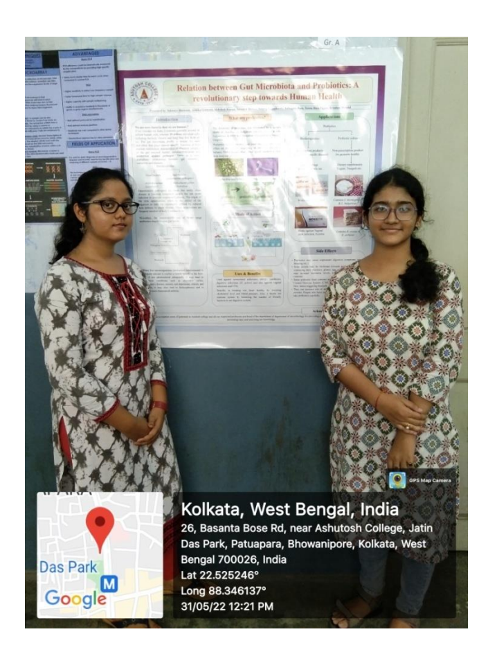
First Rankers (Gr. A)