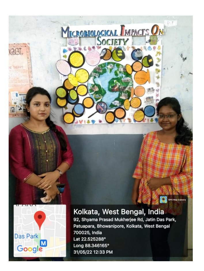
Second Rankers (Gr. E)