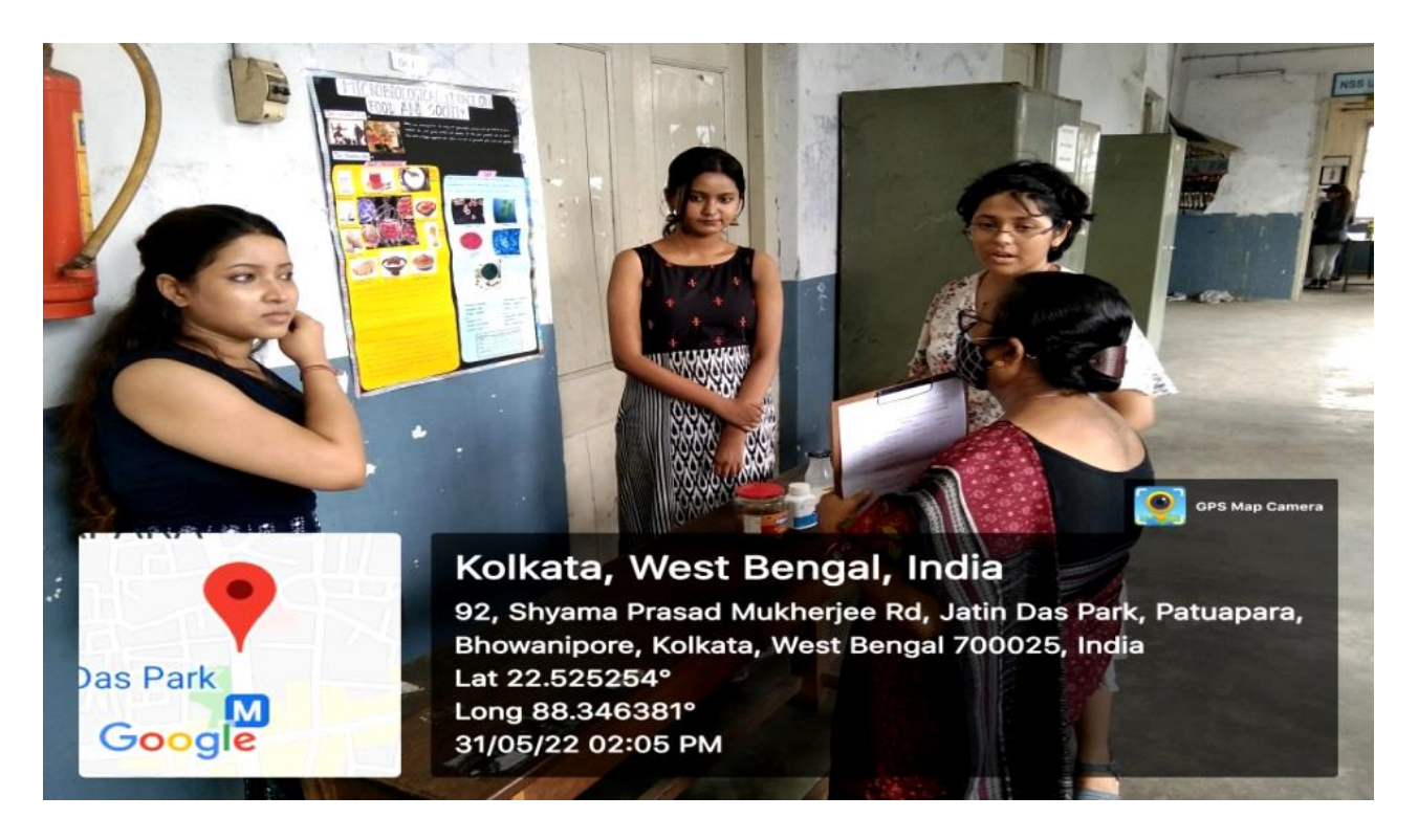
Judges interacting with students (Gr. I)