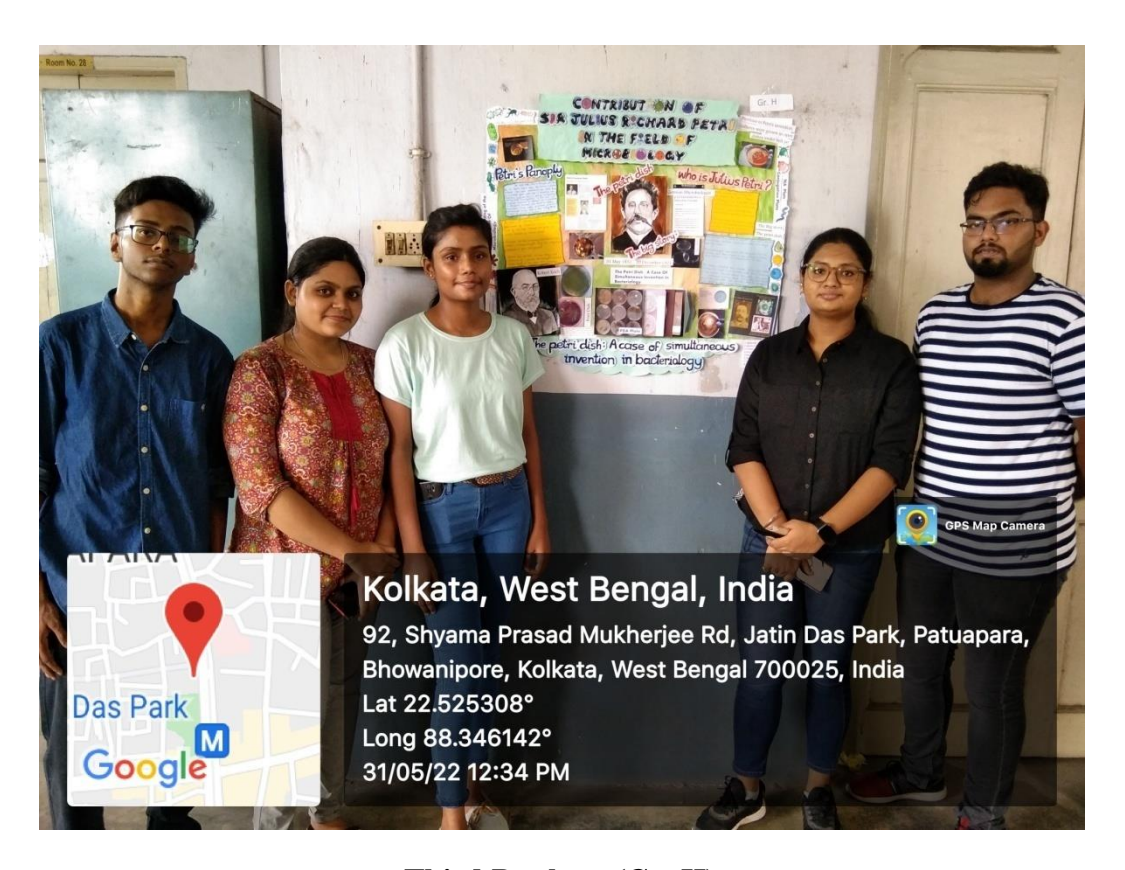
Third Rankers (Gr. H)